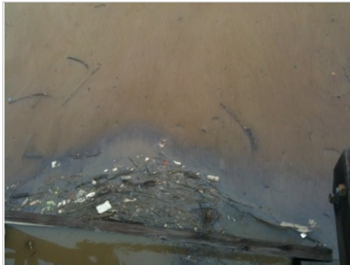
A view of the petroleum substance that spilled into the Anacostia River Monday evening.

August 16, 2011 - A large quantity of an as yet unidentified petroleum product spilled into the Anacostia River Monday evening.